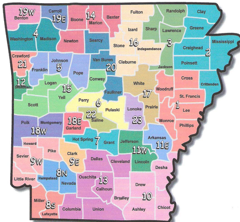
Arkansas Circuit Court Districts